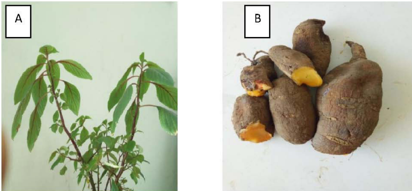
Figure 1 The I.tinctoria A. Rich A) parts above the ground B) Roots