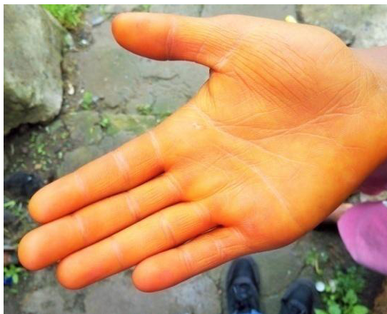
Figure 2 Dyed palms by a paste of I.tinctoria A. Rich roots

vernacular name in Amharic, “Insoila”. It is an upright perennial herb that grows to approximately 2 metres tall. It develops a large tuberous rootstock that lies at or just below the soil surface (figure 1). 15 It is native to East Africa and found many parts of Ethiopia. 16 Flora biodiversity assessment studies recorded as I. tinctoria A. Rich is one of the most abundant herb species in Bonga Forest, Oromia Region of Ethiopia and in Mahoney / Maichew, Southern Tigray Region of Ethiopia has been found out as the dominant cash herb. 17,18